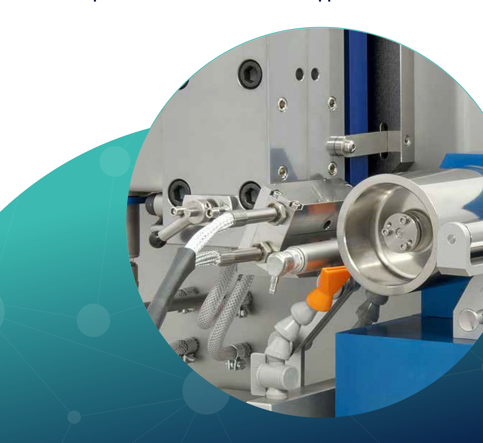
Table top micro cast film line for R&D applications